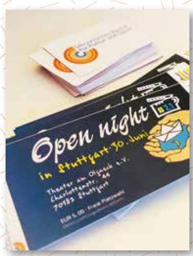
Eintrittskarten des Festivals