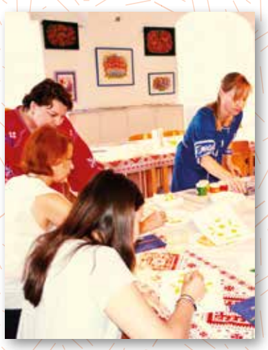
Workshop & Exhibition in Landesmuseum