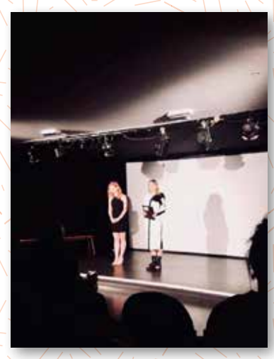
Eröffnung des Festivals