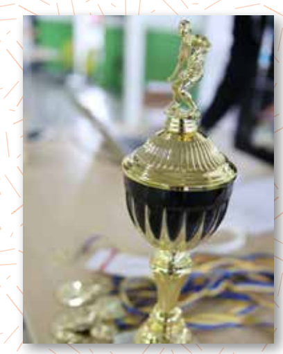
The Diaspora Cup 2018

Ukrainians from the whole Germany and Austria came to Stuttgart to take part in the competitions.