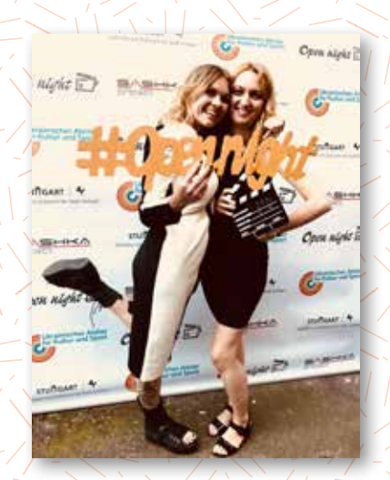
Fotowand des Festivals

The event was funded by "Kulturamt Stuttgart".