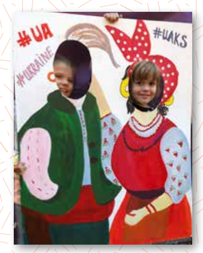
Sommerfestival der Kulturen 2018