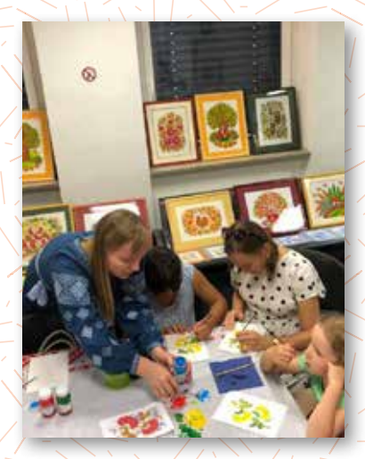
Workshop in Munich

Apart from Stuttgart the workshops took also place in Munich (together with the General Consulate of Ukraine in Munich) and in Hahnenbach during the Ukrainian Folksfestival.