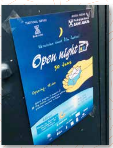
Plakat des Festivals