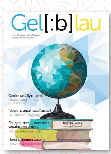
Edition No 9 (Fall)