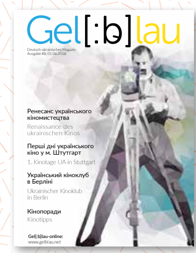
Edition No 8 (Summer)