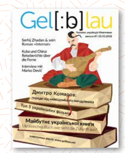
Edition No 7 (Spring)

Official Facebook Page: fb.com/gelblau.ua Official Web Page: www.gelblau.net