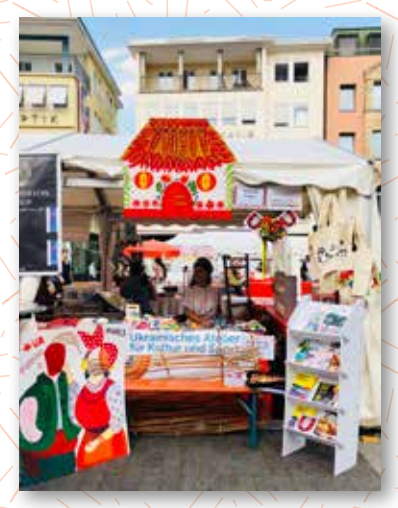
Sommerfestival der Kulturen 2018

Due to UAKS e.V. Ukraine was presented at those festivals already for the second time. Thousands of people visited our ukrainian booths, enjoyed the ukrainian specialities and got a lot of knowledge about Ukrainian traditions.