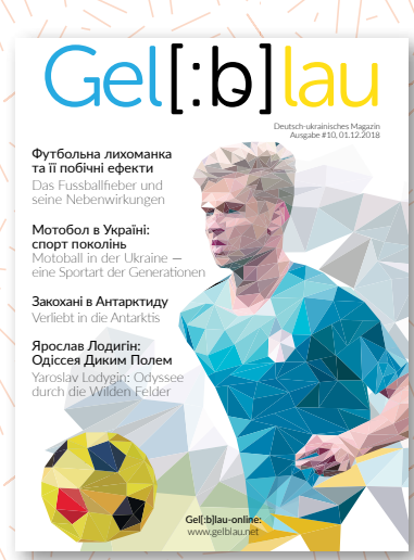
Edition No 10 (Winter)